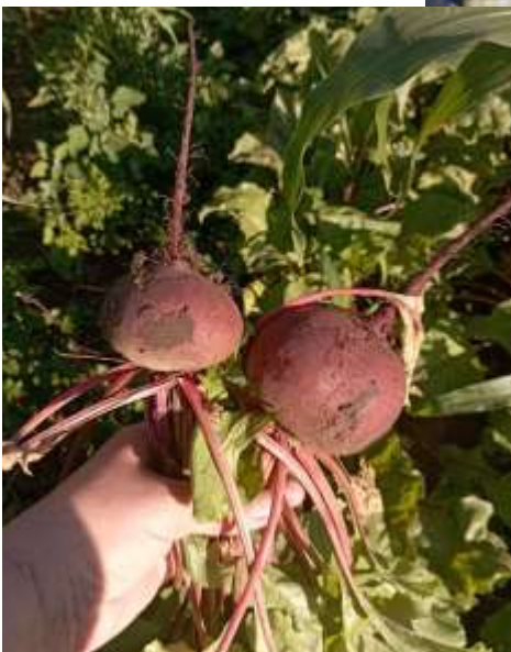
From their 2024 harvest.